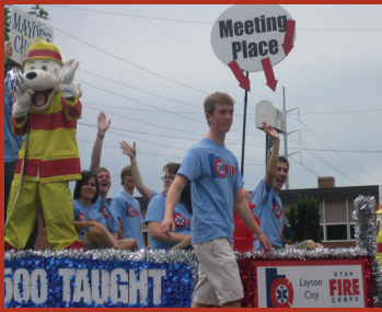
The Fire Corps also raised funds and built a float for the city parade, receiving the Mayor's Choice award.