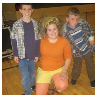
The Fire Corps drama club heroine posing with her elementary fans.