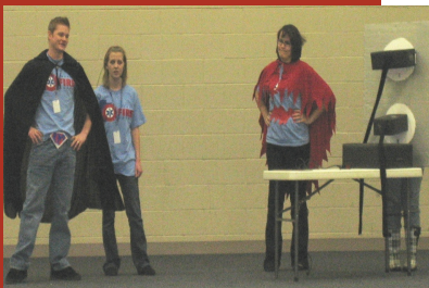
Layton City Fire Corps teaching fire safety at a local elementary school.