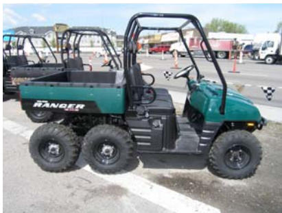
'Utility Type Vehicle'