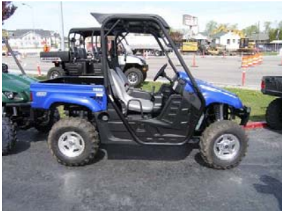
'Utility Type Vehicle'