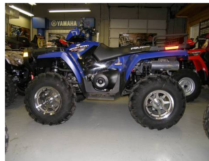
All-terrain Type I Vehicle

Note: Sandrails, Rock Crawlers, and go-carts will not be allowed to be inspected and registered as a street-legal ATV.