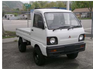
'Utility Type Vehicle'